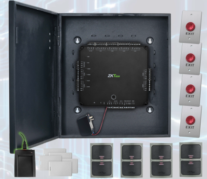
Atlas400-4 Door KIT